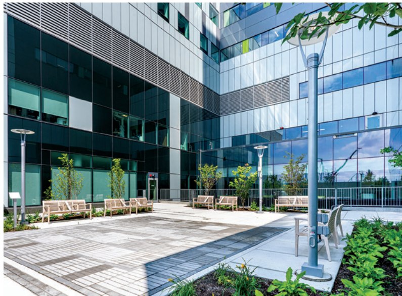
The Spiritual Care Courtyard is a peaceful refuge allowing patients and families to connect to their spirituality.

One of the four main public elevators has a Sabbath mode — stopping at all public floors automatically so that those who observe the Sabbath can visit their loved ones. It also has illuminated lobby signage to advise waiting passengers that Sabbath Service is in effect.