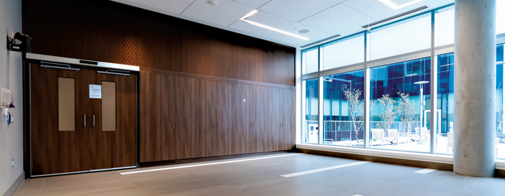
The light-filled Multi-Faith Room welcomes people of all faiths and has access to the Spiritual Care Courtyard.