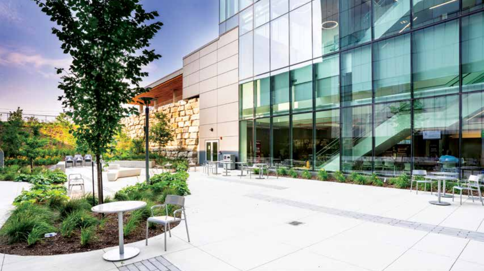
The main courtyard with cascading gardens, adjacent to the atrium, was designed with lush greenery and open spaces to create calming and restful areas for patients and families who are undergoing care and treatment, or who need relief during stressful times.