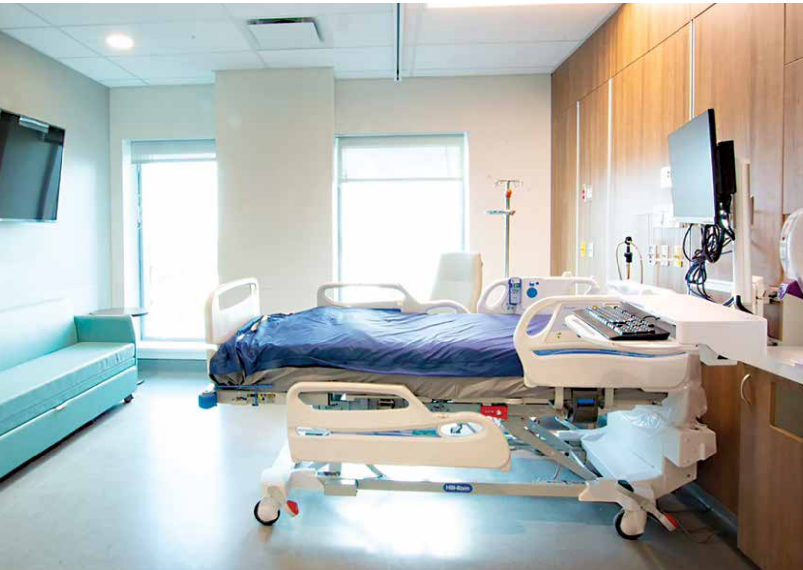
This is a patient room, which will include a smart bed, bedside tablet and a computer to document care in real time, among many other features.

Located on levels six to eight, the medical and surgical inpatient units at Cortellucci Vaughan Hospital will provide comprehensive support for those who are recovering from surgery, receiving care for acute conditions such as a broken leg, or treatment for a progressive and chronic disease like dementia.