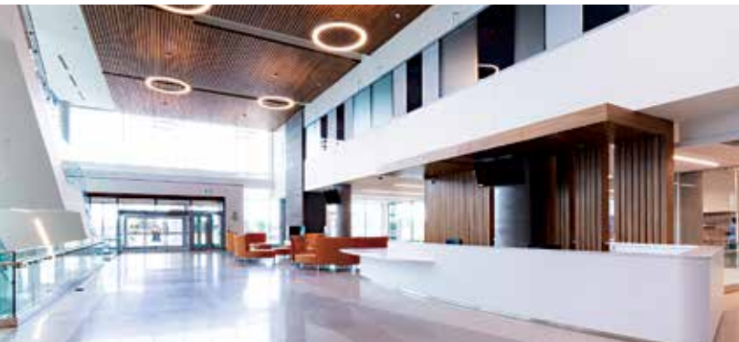
Throughout the hospital, there is exposure to natural light and orienting views to the outdoors, including in the Vic De Zen Family Welcome Centre main lobby, inpatient rooms, food court and elevator lobbies.