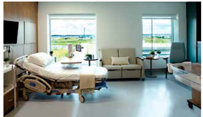
The Woman and Child Program at Cortellucci Vaughan Hospital will feature a new model of care in which women labour, deliver, recover and receive postpartum care in the same room that includes space for extended family visitors and a second parent or caregiver to remain overnight.