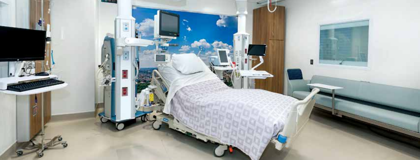
This is a Critical Care Unit patient room, which will include special moveable technologies to rotate the entire bed, ceiling lifts and floor-to-ceiling windows, among many other features.